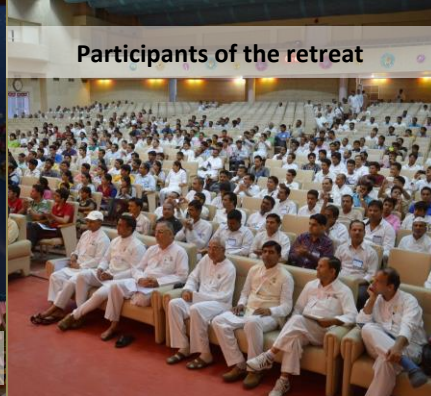
Participants of the retreat