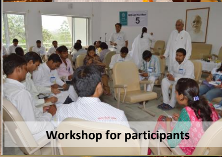
Workshop for participants