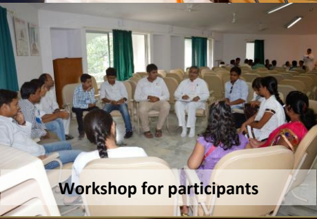
Workshop for participants