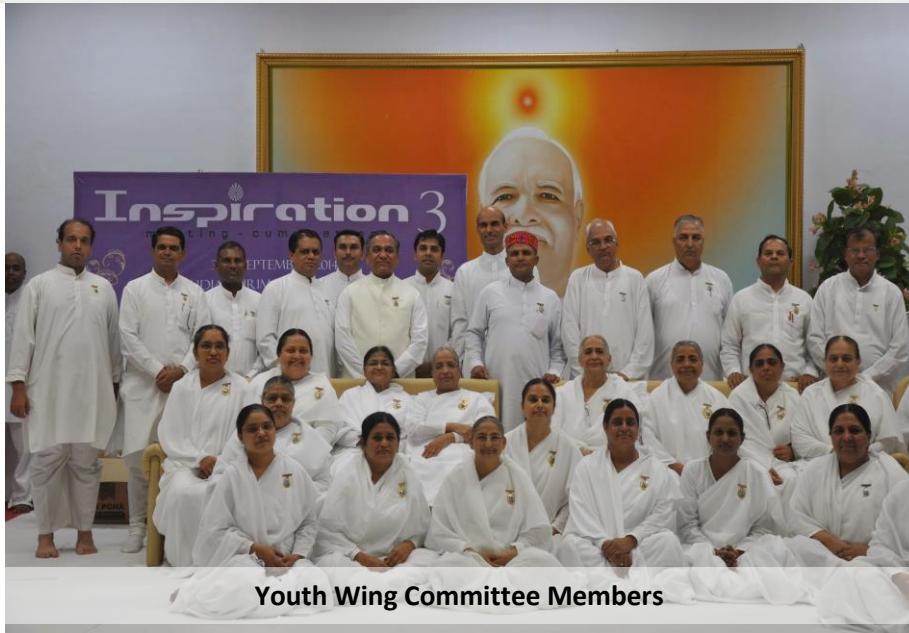
Youth Wing Committee Members

Shantivan campus Mount Abu 3 rd September to 5 th September 2014