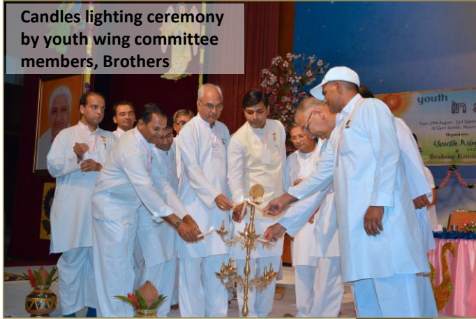
Candles lighting ceremony by youth wing committee members, Brothers