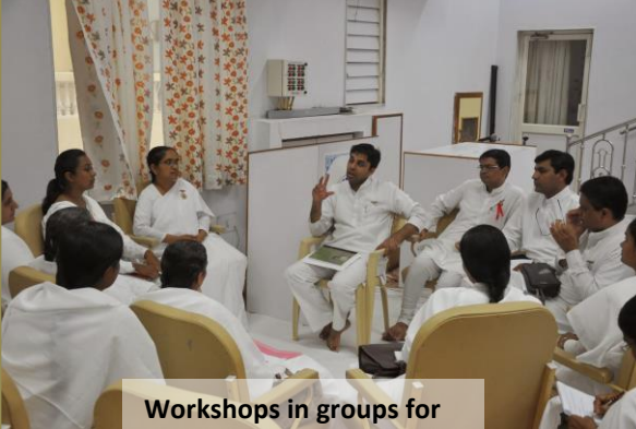
Workshops in groups for further planning of youth