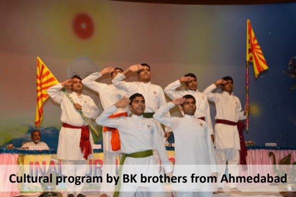
Cultural program by BK brothers from Ahmedabad