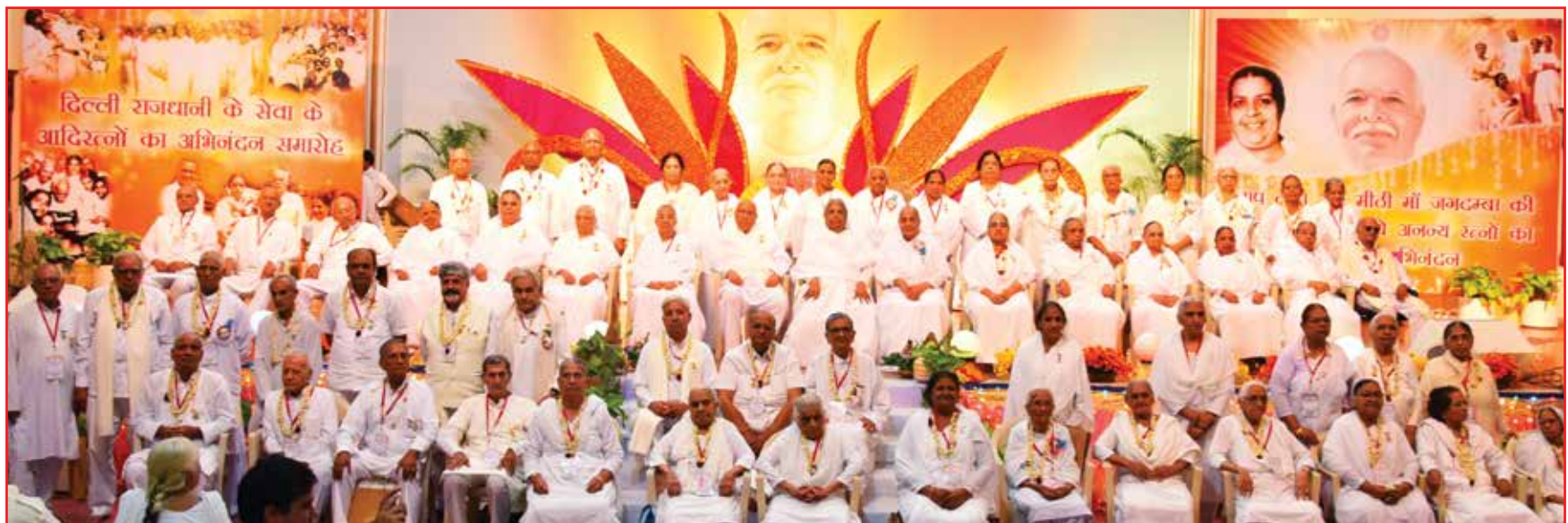
Om Shanti Retreat Centre, Gurugram : Group photo of participants in honouring ceremony of Delhi Zone 'Adi Ratans' who took direct sustenance from Pitareshri Brahma Baba when Baba was in corporeal form.

Just as a kite flies high, held only by a string, our intellect can rise to the heights of wisdom, pulled only by the thread of spiritual love.