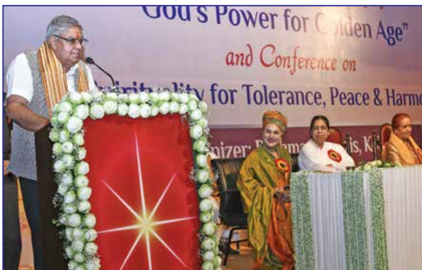
Kolkata: Hon'ble Jagdeep Dhankhar, Governor of West Bengal, speaking during a programme on 'God's Power for Golden Age', organised by BK Sister Kanan, Incharge, Kolkata Museum, at Kalamandir Auditorium.