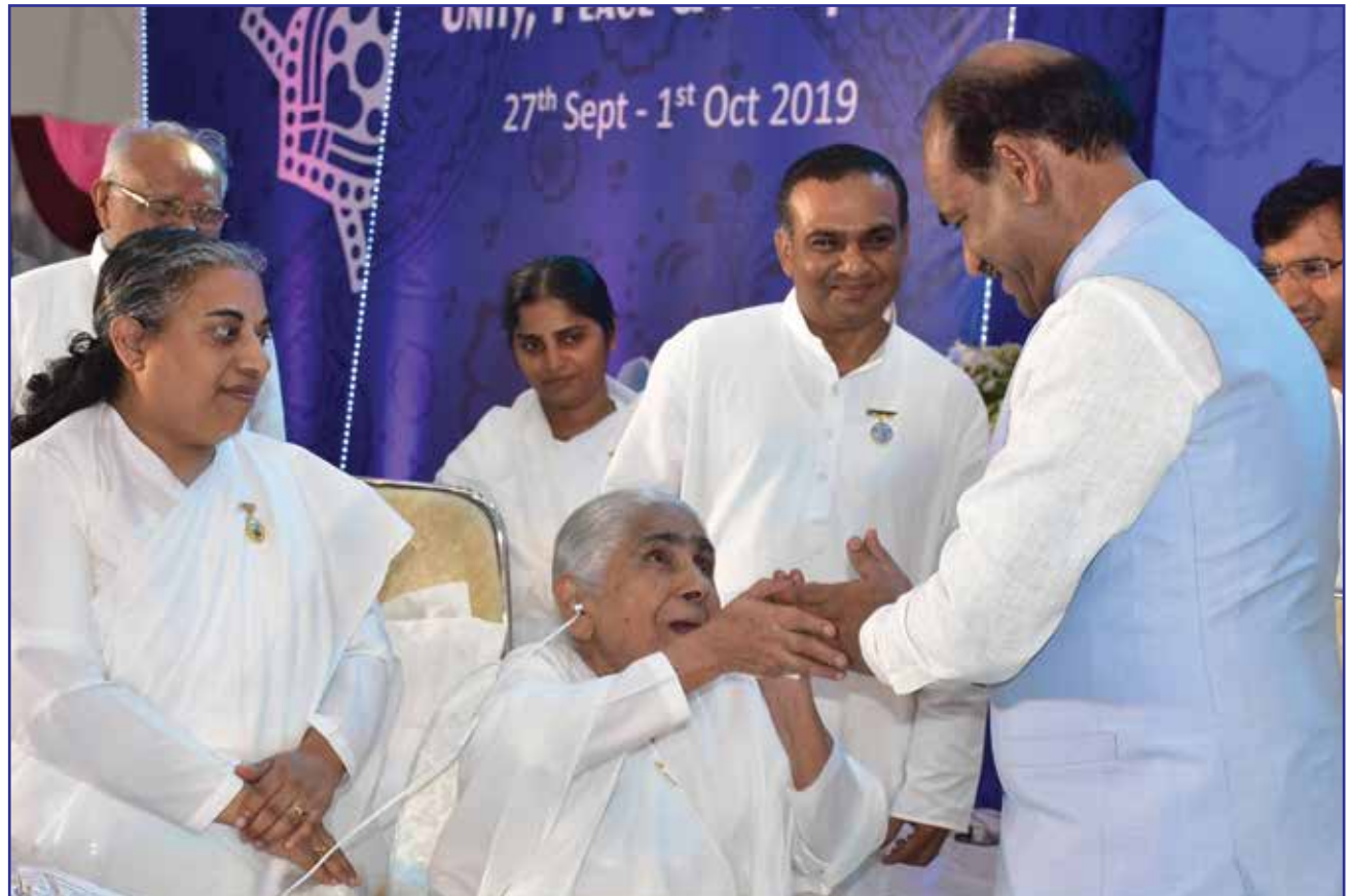
Shantivan, Abu : Mr. Om Birla, Hon'ble Speaker of Lok Sabha paying respects before meeting with Dadi Janki, Chief of Brahma Kumaris during his visit to Brahma Kumaris Headquarters after giving Valedictory Speech at Global Summit.

Detachment is a talent as well as an art. It is developed through soul consciousness