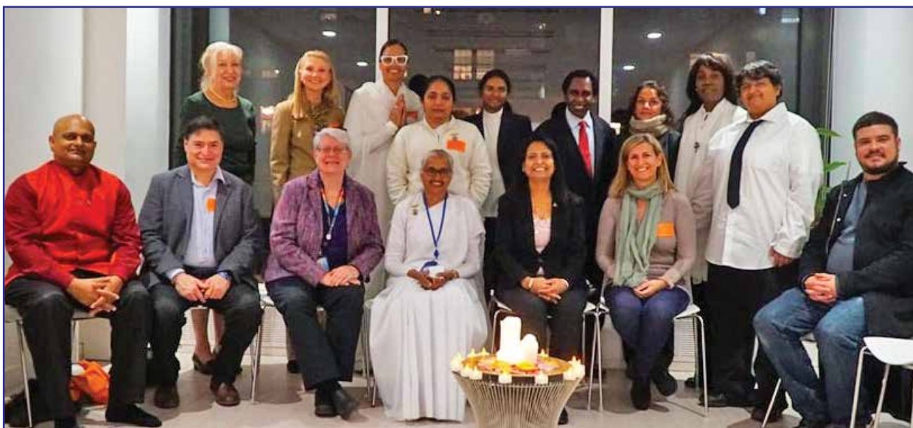
New York City, USA: Diwali and UN Day celebrations at Brahma Kumaris Office. Many friends gathered to rekindle the spirit of the UN and strengthen the torch within.