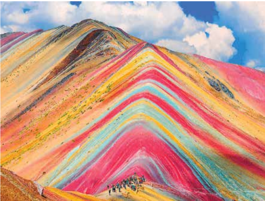
Delightful Rainbow Mountains in China have to be seen to be believed.