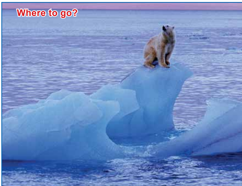
Where to go?