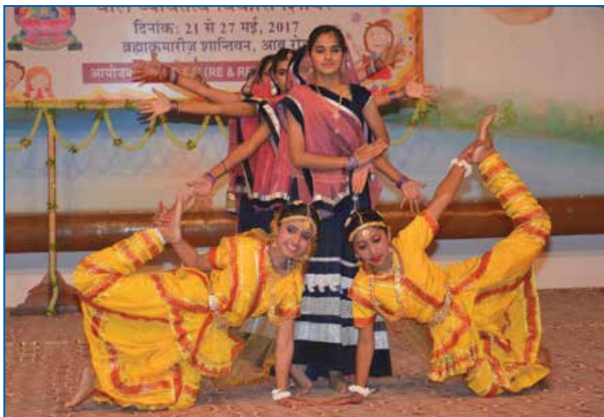
Abu Road, Shantivan: Cultural performance on the occasion of All India Children's Personality Development Camp 2017.