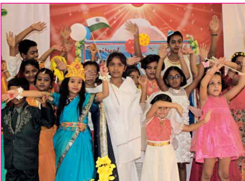
Ranchi, Jharkhand: A view of children at Summer Camp 2017, organised by the local Brahma Kumaris centre.