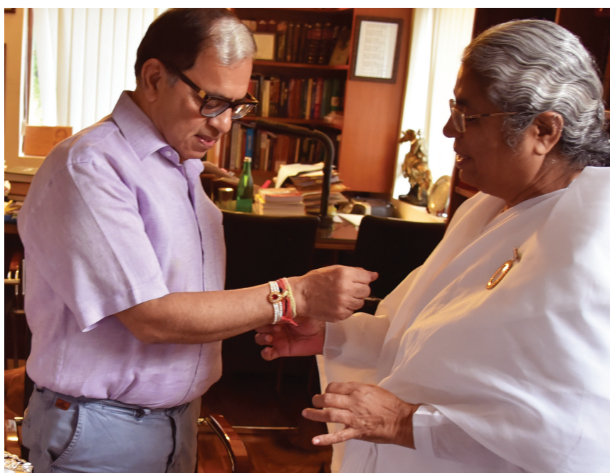
New Delhi: Hon'ble Mr. Justice A.K. Sikri of Supreme Court, being tied 'Rakhi' by BK Asha didi.