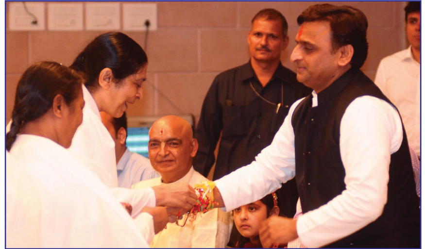
Lucknow : Mr. Akhilesh Yadav, Hon'ble Chief Minister of Uttar Pradesh, being tied 'Rakhi' by BK Radha.