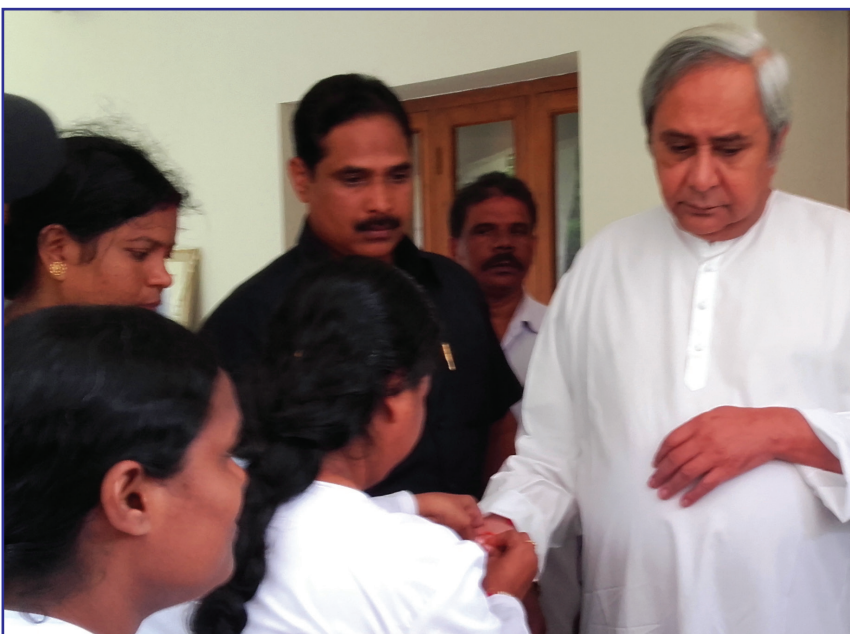
Bhubaneswar : Mr. Naveen Pattnaik, Hon'ble Chief Minister of Odisha, being tied 'Rakhi' by BK Geeta.