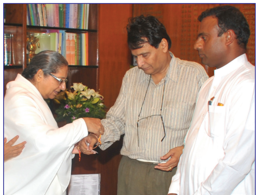
New Delhi: Mr. Suresh Prabhu, Hon'ble Union Minister of Railways, being tied 'Rakhi' by BK Lakshmi accompanied by BK Raghu.