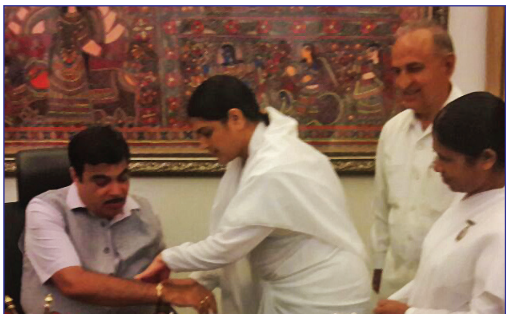
New Delhi: Mr. Nitin Gadkari, Hon'ble Union Minister of Road Transport, Highways and Shipping, being tied 'Rakhi' by BK Sunita, accompanied by BK Shubhakaran and BK Savita.