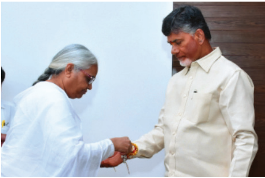
Vijaywada: Mr. Chandrababu Naidu, Hon'ble Chief Minister of Andhra Pradesh, being tied 'Rakhi' by BK Shantha.