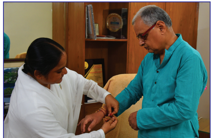
New Delhi : Hon'ble Mr. Justice P.C. Pant of Supreme Court, being tied 'Rakhi' by BK Brunda.