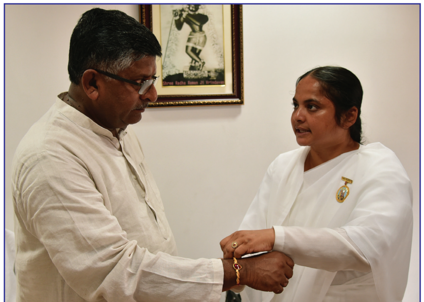
New Delhi : Mr. Ravi Shankar Prasad, Hon'ble Union Minister of Law & Justice, being tied 'Rakhi' by BK Brunda.