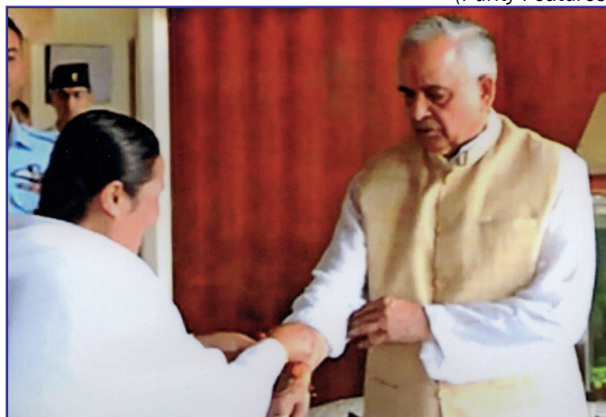
Aizawl : Lt. Gen. Nirbhay Sharma, PVSM, UYSM, AVSM (Retd.) Hon'ble Governor of Mizoram, being tied 'Rakhi' by BK Narmada.