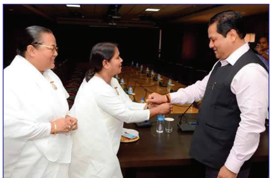
Guwahati : Mr. Sarbananda Sonowal, Hon'ble Chief Minister of Assam, being tied 'Rakhi' by BK Alpna accompanied by BK Poonam.