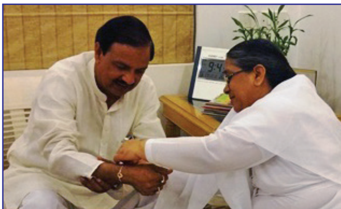
NOIDA, UP: Dr. Mahesh Sharma, Hon'ble Union Minister of State for Culture and Tourism, being tied 'Rakhi' by BK Manju.