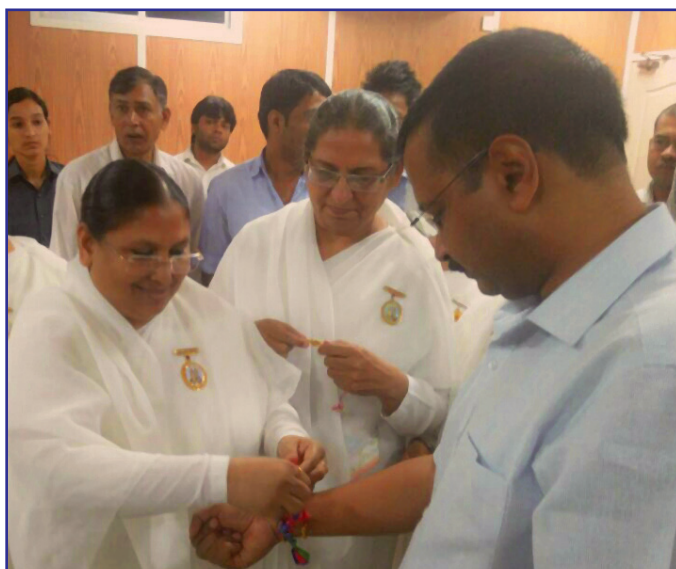
Delhi: Mr. Aroind Kejriwal, Hon'ble Chief Minister of Delhi, being tied 'Rakhi' by BK Urmil.