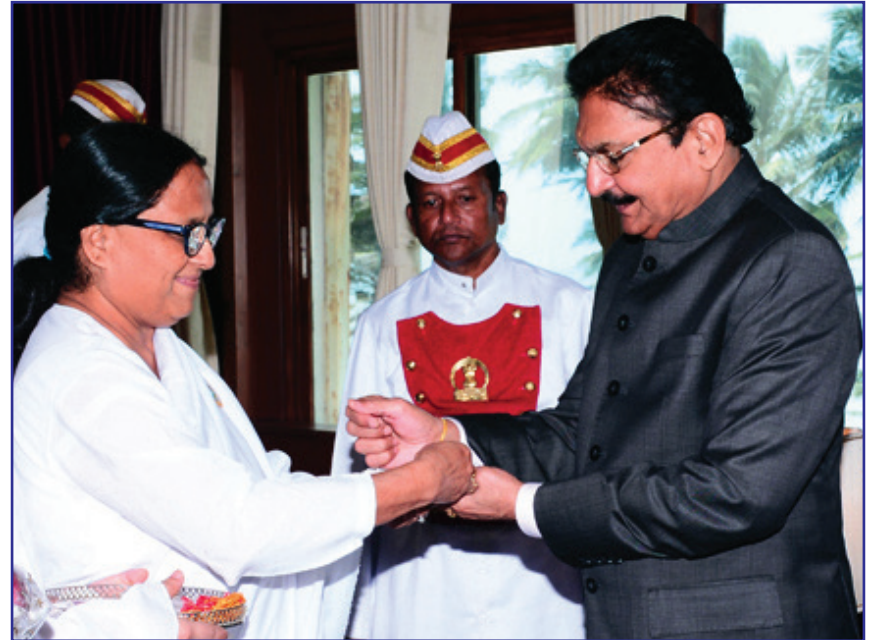
Mumbai, Napean Sea Road: Mr. Vidyasagar Rao, Hon'ble Governor of Maharashtra, being tied 'Rakhi' by BK Rukmani.

Just as the day declines towards the darkness of night with every passing second, but the positive transition – that is movement from darkness to light – takes place in the few hours around pre-dawn, it is the case with the world drama. While the world constantly ticks from a state of perfection to imperfection and, finally, utmost degradation, throughout the cycle of time, the exception is the Confluence Age.