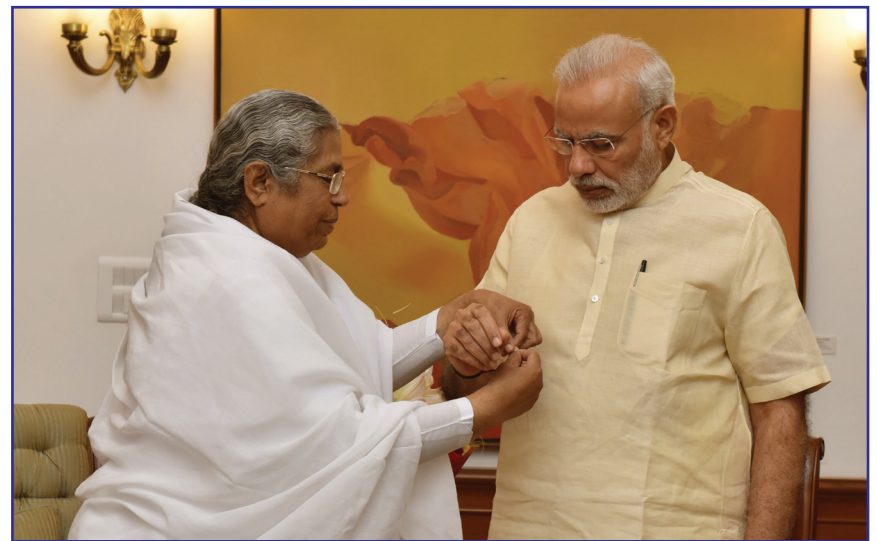
Mr. Narendra Modi, Hon'ble Prime Minister of India, being tied the sacred thread of protection, 'Rakhi', by Brahma Kumari Asha at the PM's residence in New Delhi.

Even where such a provision does not exist, convicts get reduced punishment if they show true remorse or cooperate with the law enforcement agencies, and sentences