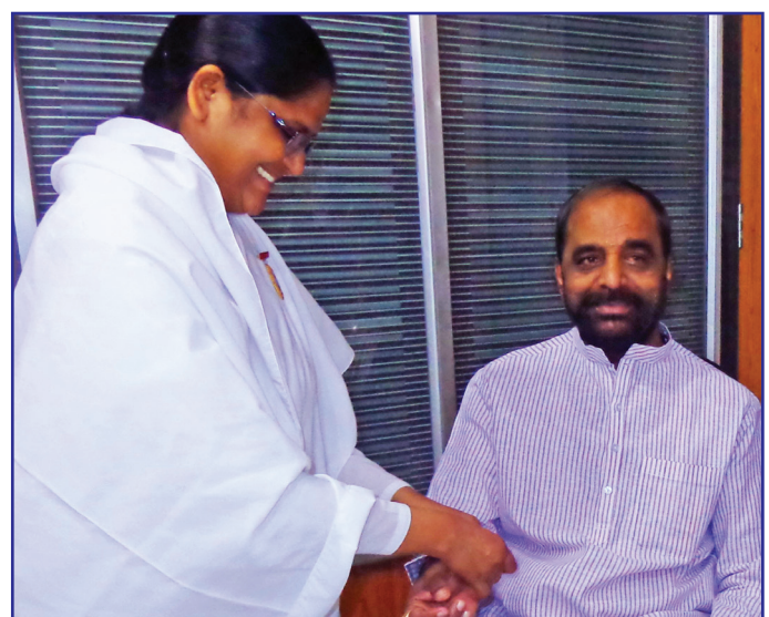
Chandrapur, Maharashtra : Mr. Hansraj Ahir, Hon'ble Union Minister of State for Home Affairs, being tied 'Rakhi' by BK Kunda.