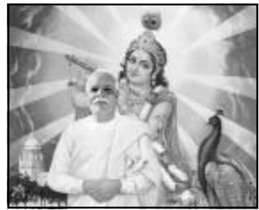
Dev , who was moulded by God "in His own image" to be the

He is really the biblical Adam in true sense of the term or Adi