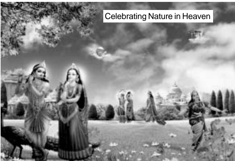
Celebrating Nature in Heaven

(i) The term ‘ Man ’ refers to all ‘human beings’ of the