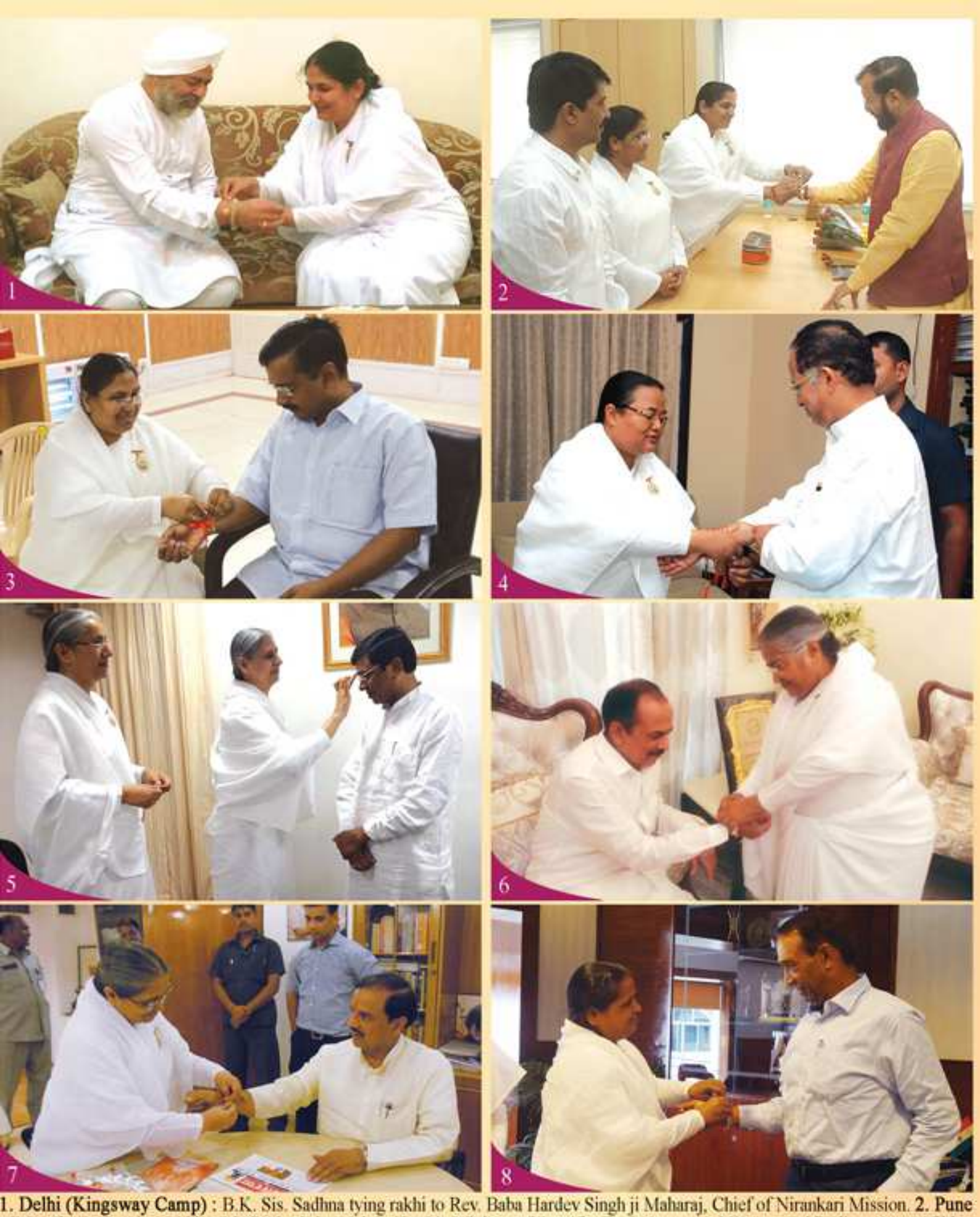
B.K. Sis. Rupa tying rakhi to Mr. Prakash Javadekar, Hon'ble Minister of State for Environment and Forests and Parliamentary Affairs, Govt. of Inda. B.K. Sis. Geetika and B.K. Deepak are also seen. 3. Delhi: B.K. Sis. Urmila tying rakhi to Mr. Arvind Kejriwal, Hon'ble Chief Minister of Delhi. 4. Guwahati: B.K. Sis. Poonam tying rakhi Mr. Tarun Gogoi, Hon'ble Chief Minister of Assam. 5. Delhi (Lajpat Nagar): B.K. Sis. Mamta applying tilak to Mr. Sudarshan Bhagat, Hon'ble Union Minister of State for Rural Development before tying rakhi. B.K. Sis. Sapna is also seen. 6. Hyderabad: B.K. Sis. Kuldeep tying rakhi to Mr. Md. Mohamood Ali, Deputy Chief Minister of Telangana. 7. Noida Sector 33: B.K. Sis. Manju tying rakhi to Dr. Mahesh Sharma, Hon'ble Minister of State for Culture, Tourism (Independent Charge) & Civil Aviation Member, State Working Committee, Govt. of India. 8. Cuttack: B.K. Sis. Sulochana tying Rakhi to Mr. Sanjeev Marik (IPS), Director General of Police, Odisha.