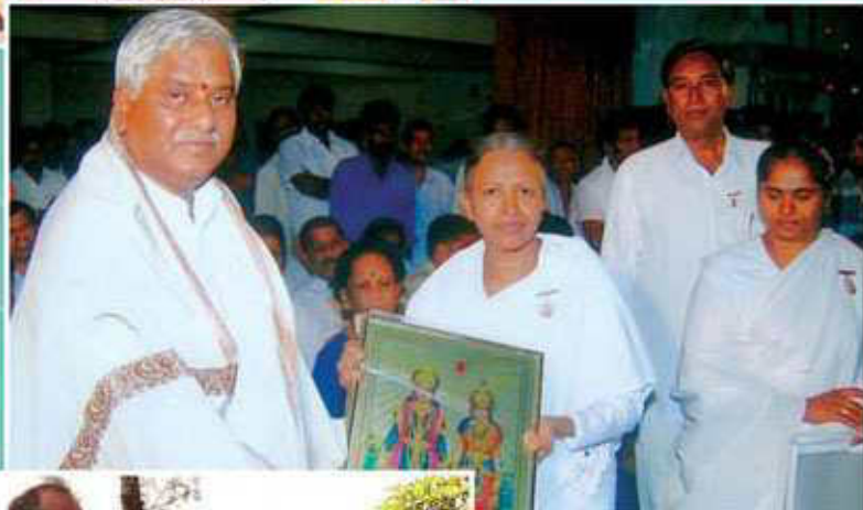
Chintamani (Karnataka): B.K. Sis. Shyamala presenting Godly gift to Justice V. Gopala Gowda, Judge, Supreme Court.