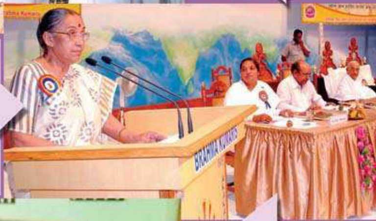
Gyan Sarovar (Mt. Abu): H.E. Mrs. Margaret Alva, Governor of Rajasthan, addressing the Valedictory Session of the Conference for Educationists.